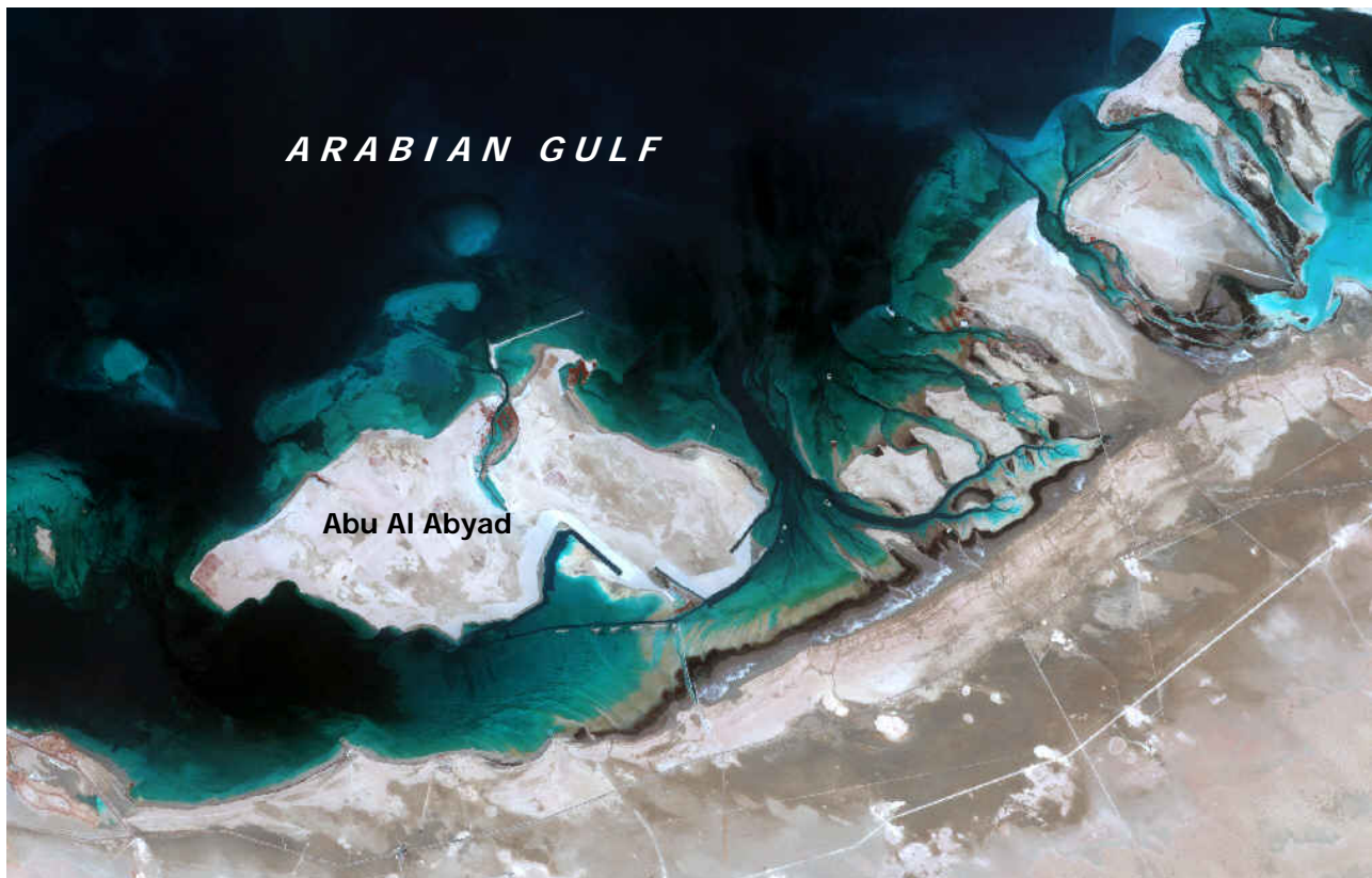
Figure 1. The Khor Al Bazam study area western Abu Dhabi as imaged by the Landsat-7 ETM+ sensor. Imagery acquired on 11 July 1999. ETM+ Bands 4,2,1 (RGB) are shown.

Kendall and Skipwith (1968; 1969a; 1969b) and Alsharhan and Kendall (in press) have studied and mapped in great detail the geological history of the area. They have revealed that the sediments of the region include skeletal grains, non-skeletal grains, carbonate mud, non-carbonate minerals and organic material. The lithofacies include: 1) corals, 2) oolitic sands, 3) pellet aggregates, 4) muds, 5) molluscan